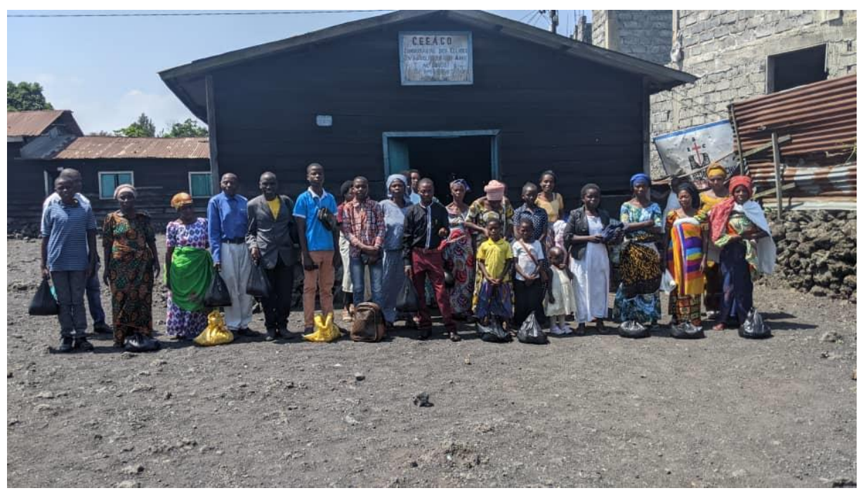
Some beneficiaries after distribution

Note: It should be noted here that apart from the Rice purchased by the fund from the Quakers in Great Britain, the Quakers of Goma collected clothes and shoes which were also distributed at the same time to the displaced people. Also, 80% of the beneficiaries were Quakers displaced in Goma and its surroundings and 20% displaced people of other beliefs (Catholics, Protestants, Muslims, etc.).