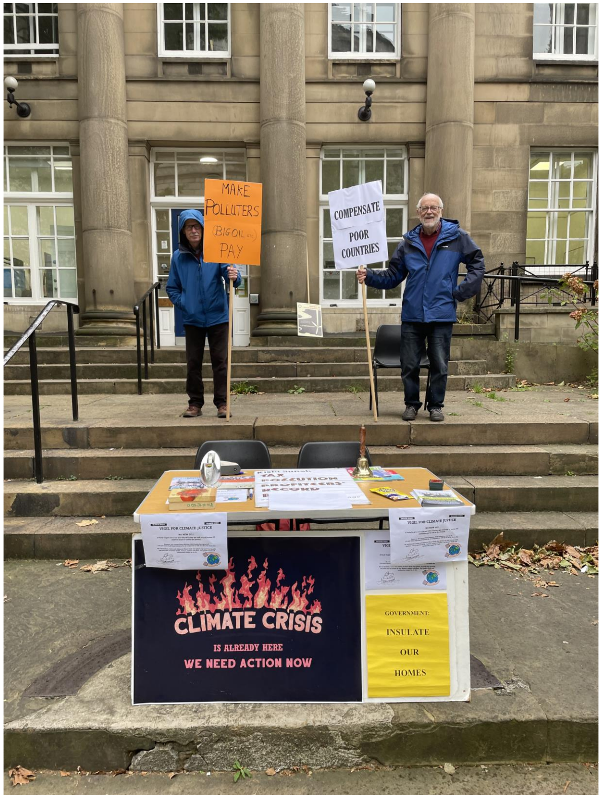
It will be repeated on Tuesday 3rd October at the time of the Conservative Party Conference